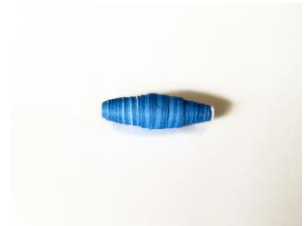
Short oblong bead